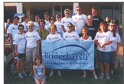
Team Bridgehaven at the start of the Live United Walk

MUW's campaign encourages area employers and community members to make a difference and impact the lives of people in need. Funds support nearly 90 agencies and 150 programs, while working to create and support long-term solutions by focusing on the areas of education, income and health.